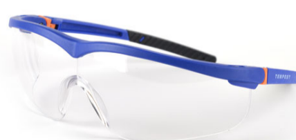
Tempest 9-Position Temples in a Wraparound Anti-Fog Lens