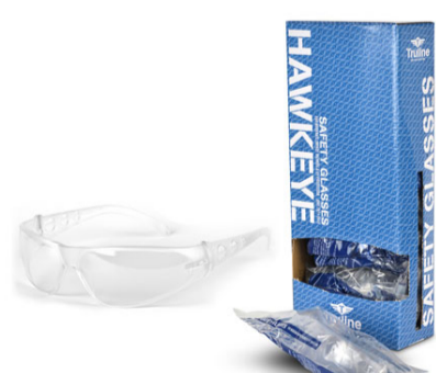
Hawkeye Economical All-around Eye Protection

Weekly deals on the TOP SAFETY PRODUCTS that are PRICED TO MOVE! Items are very limited and available while supplies last.