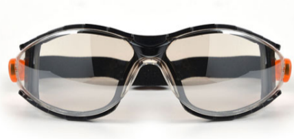
Wraptor 110 Indoor/Outdoor Lens