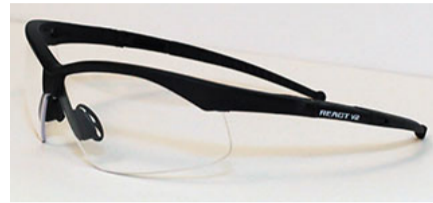
React V2 All-around Eye Protection