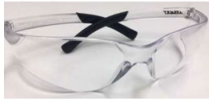
Assault 113 All day comfort with non-slip temples